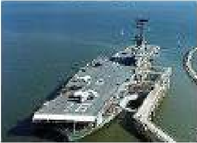
USS Lexington Ship Texas

Did someone say that the USS Lexington was haunted? A former crew member says that is true. Ghost hunters on the science fiction channel ran a special on the USS Lexington.